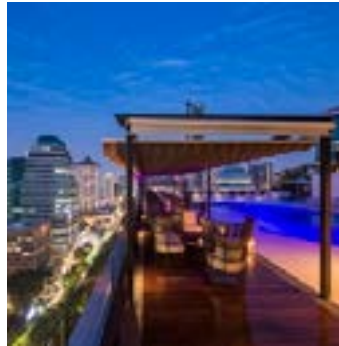
The Sky bar

Welcome aperitif at the Sky bar (24 th Floor) Free evening